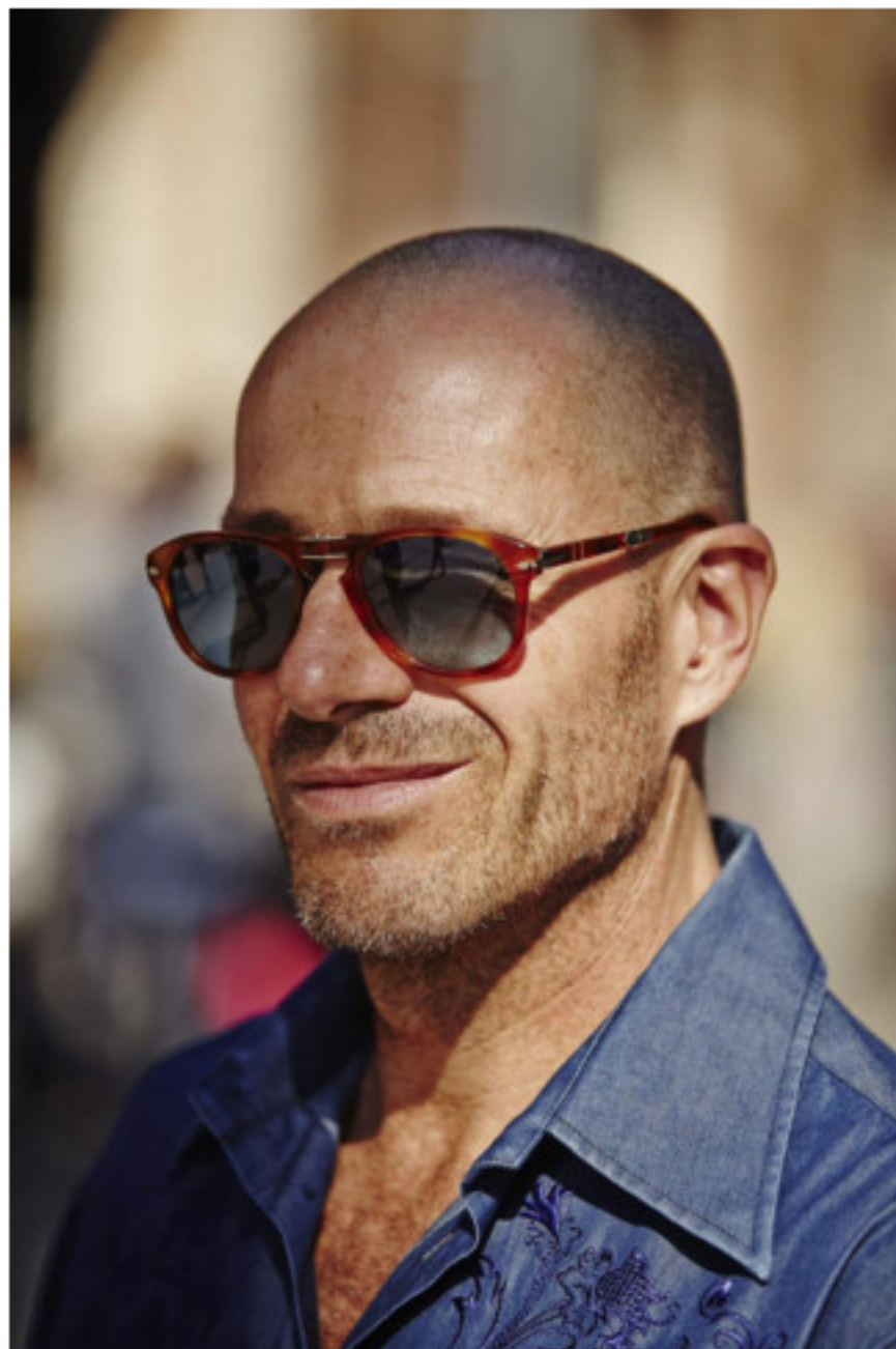
click image to enlarge